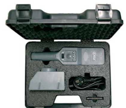
V140 CARRYING CASE

SUPERIOR DETECTION, ERGONOMICS, VERY COMFORTABLE TO USE