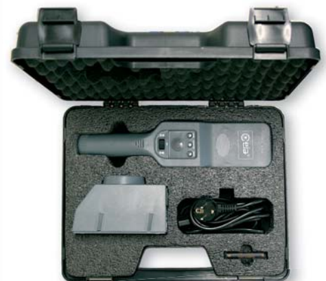
V140 CARRYING CASE